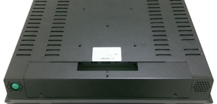
Support: Specifications | Pictures

D150 is a 15 inch all-in-one computing system with Intel Bay Trail processor in fanless system design. With single touch functionality and protected by IP64 front sealed chassis, all of these are aiming to provide the most stable and reliable quality for wide application and different environmental conditions.